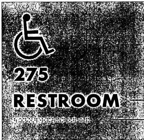
Restroom Room Sign

Lettering 5/8" Min - 2" Max Corresponding Grade II Braille